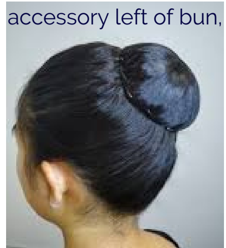
High bun accessory left of bun,