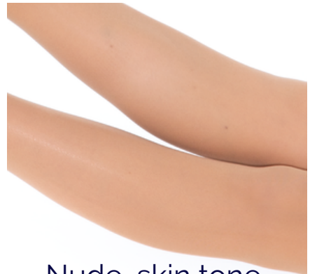
Nude, skin tone convertable tights