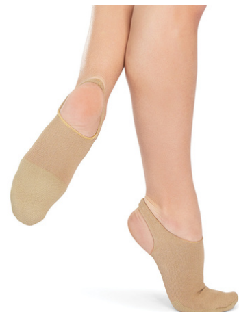
Nude, skin tone contemporary socks