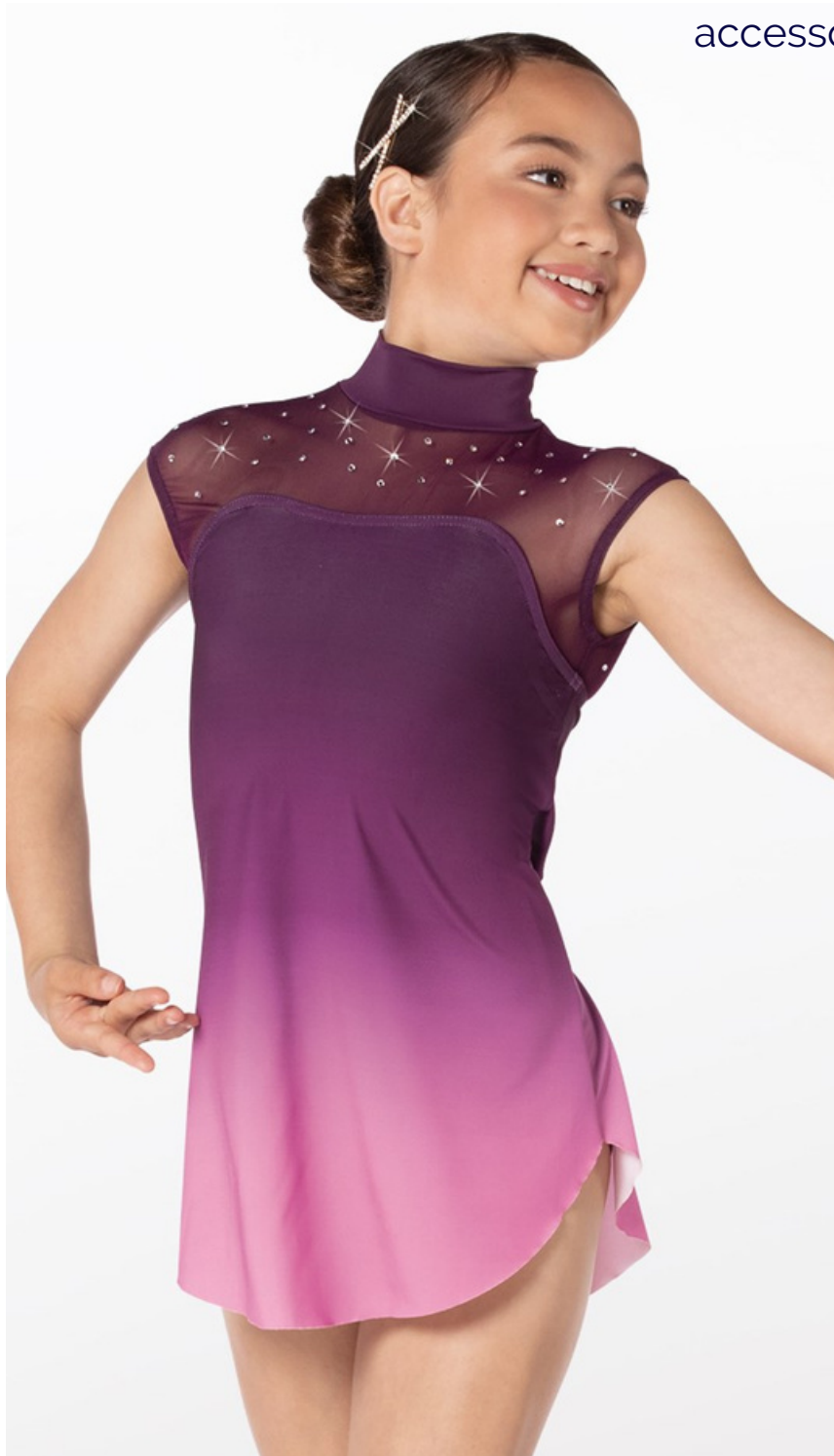
High bun accessory left of bun, crossed